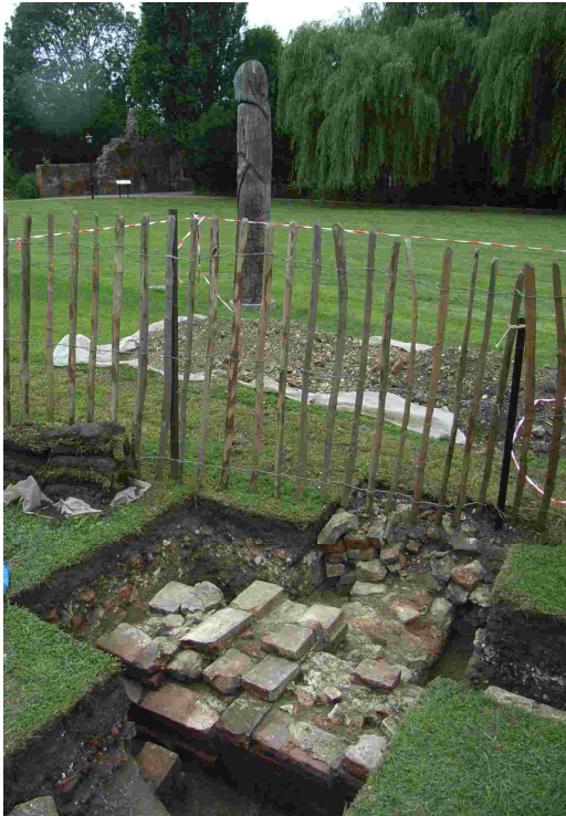
S. E. corner of infirmary, with extension running further south. Looking S. W. toward 'Ancestor' and Abbey Gatehouse

Evidence of the southern end of the aisled building was uncovered, showing that the south eastern corner had been repaired (with Waltham 'Great Bricks') after fire damage, and that a further building had stood slightly to the south, which Peter suggests may have accommodated the infirmarer who ran the establishment.