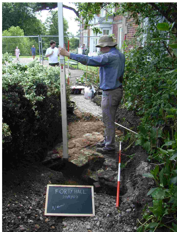
Recording of an 18 th C or earlier courtyard wall at Forty Hall, exposed in 2007 during refurbishment of access to the public toilets (See p. 5). For female head, see Small Finds (pp. 4 & 10)

The Bulletin of the Enfield Archaeological Society