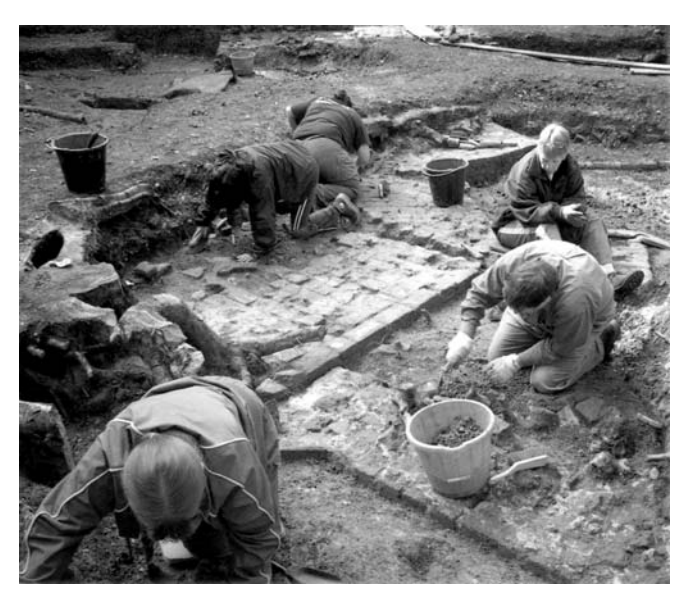
WEAG training dig 2004

Also in 2003 WEAG and the Trust experimented with running a small commercial training excavation, lead by professional archaeologists and supported by WEAG. This was a great success and was repeated on a larger scale in the late summer of 2004, preceded by a dig for WEAG members at Whitsun. These digs were successful in revealing much more of the floorplan of the hall, revealing that there were clearly distinct phases of construction, though these cannot yet be analysed in any detail.