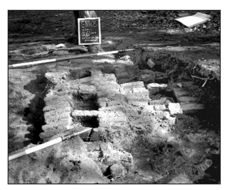
Exciting results from our April dig in the vicinity of Elsyng Palace at Forty Hall (see Pastfinders News)

Society News is published quarterly in March, June, September and December.