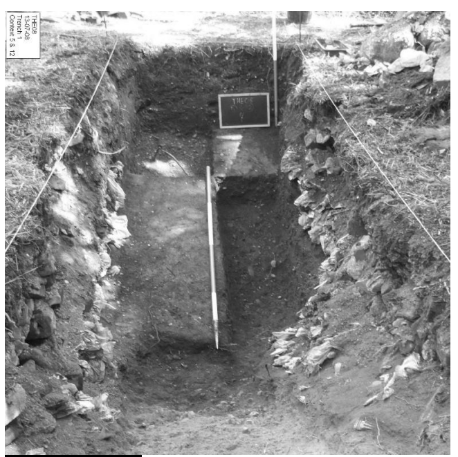
Fig 2: Trench 1

The borough supplied a minidigger and driver to deturf and take off the topsoil. This was fortunate as it rapidly became clear that the canal had in fact still been quite a prominent and deep feature until the 1970s/1980s when it had been machine filled with a layer of litter bin material (glass bottles, drinks cans, plastic bags, food wrappers etc) up to 60 cm thick and then with up to 65 cm of loose brick and concrete demolition material plus a number of blocks of worked stone probably cleared from some other part(s) of the park. This made for a potentially hazardous situation as the dumps were less than stable and limited what excavation could be undertaken of the lower fills of the canal.