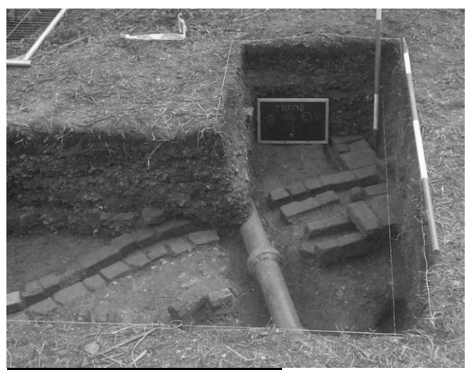
Fig 6: Trench 2 from the north

and it probably relates to some point between 1785, when maps fail to show anything but a single path here, and 1883 when they suggest a rectilinearly planned garden unlikely to be so landscaped. In fact the network is very likely to be part of the garden here which we know was held by a Robert Kennard in 1842 and it is tempting to attribute the renovation and flint decoration of the island to the same phase.