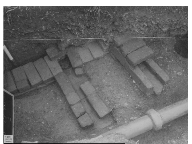
Fig 5: Close-up of the two drains

Through the void the channel connected to a drain with a steep southerly fall towards the canal. This drain appeared to be identical in construction to a second which also met its top at right angles 30 cm north of the channel. These drains were constructed of unmortared red bricks and part bricks identical to those in the channel, the floor of bricks lain as headers along the orientation of the drain, the sides by bricks lain on edge at the level of, but not overlapping, the top of the flooring course, and the roof by bricks lain on the tops of the sides as stretchers with respect to the orientation of the drain. The internal dimensions of the drains were 10 x 10 cm. The second drain clearly fed (down) into the first but how far the second extended is uncertain. Only c. 50 cm of it survived (and then damaged) and whether two bricks c. 60 cm further north east also represented a remnant of it (if so curving to the north) was not clear. However, it clearly had a steep fall to the south west implying that, as it could not have remained in tact long unless buried, the ground surface rose steeply towards the north and east, implying the presence of garden landscaping which was subsequently truncated along with most of the drain.