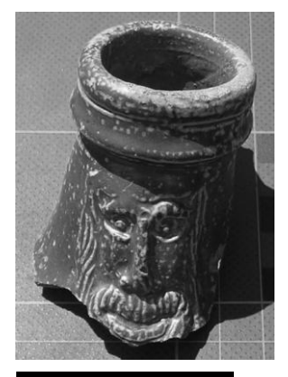
Fig 3: Bartmann jug

The second trench again produced little from the time of the palace except part of a Frechen Bartmann (Bellarmine) iug with a bearded face mask from much later drain trench, but it was full of evidence for the later history of the area as gardens running down to the canal.