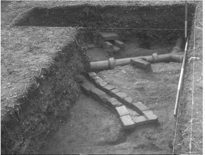
Fig 4: Trench 2 from the east, showing open channel in foreground

The earliest evidence was for a network of land drains and an open channel at the west end of the trench. The network included a somewhat serpentine north east to south west open topped channel, 2.7 m long, 26 – 30 cm wide and 8.3 cm high, internally 8 – 10 cm wide and 6.5 cm deep with a gentle fall to the south west. It had been reasonably carefully constructed of unmortared reused bricks and part bricks lain on edge on top of the margins of a line of (?roof) tiles with a part brick blocking the north east end, which widened a little, and what appeared to be two part bricks on top of each other blocking the south west end just beyond a rectangular (12 x 14 cm) basal void.