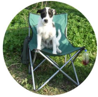
Directing at Cullings Manor, 2009