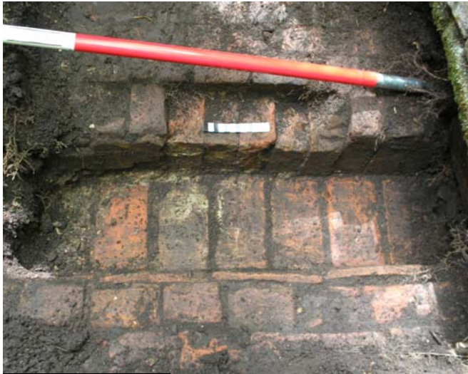
Empty beam slot

Whilst the two southernmost slots were empty, the remainder contained 20x20cm (8x8") timber beams set flush with the brick floor. It is therefore deduced that all these slots carried such timbers and are beam slots. (Fig 2)