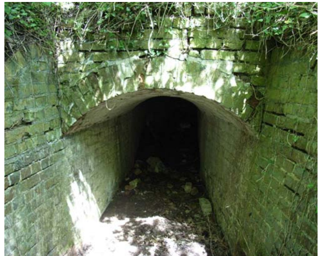
Opening of culvert into gully from below (S)

This brick vaulted culvert descends south for nearly four metres at an angle of ten degrees, after which the angle increases to twenty degrees for nearly eight metres, before returning to ten degrees for the final two metres, where it widens out to discharge into an open brick lined gully. The gully continues South for a further 16.4m, over which it continues to fall another 60cm. (Fig 1)