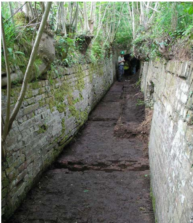
EAS members investigating a brick lined gully & culvert of the New River on the old Forty Hall estate (see p. 8).

The Bulletin of the Enfield Archaeological Society